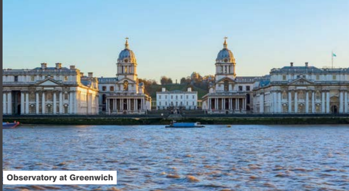
Observatory at Greenwich