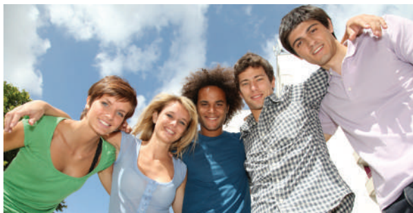
A wide range of leisure activities