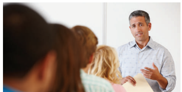
Qualified and dedicated teachers