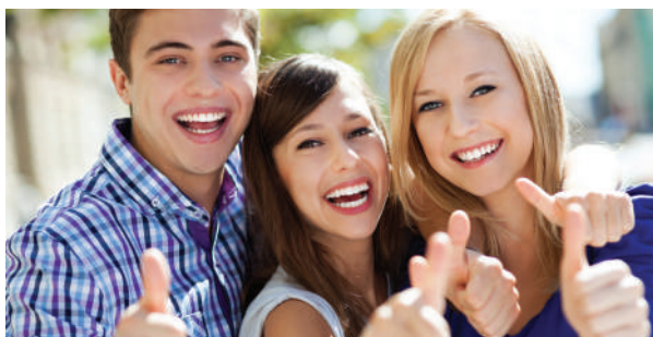
Amazing value for money