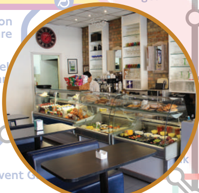
Ice Cream Parlour